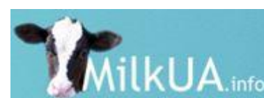
Portal of milk and dairy farming