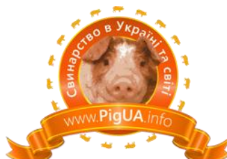
Pig production in Ukraine and worldwide