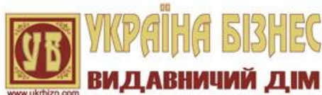
Publishing house "Ukraine Business"